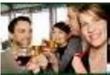
Safe Food Handling