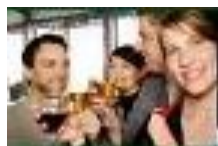
Safe Food Handling